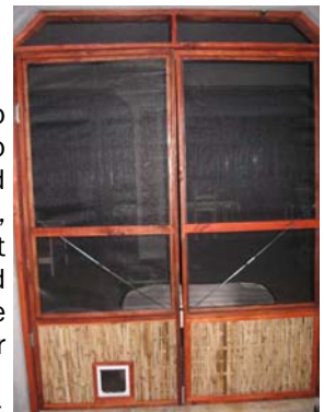
Front door screens.

The Haitian crew continues to work on the kitchen depot just out the back door. It is built and they are putting the cement finish on the walls. They say it should be done by the 15 th of May. I am so excited about getting a depot to put my stuff in! I have so many bins with things to give away, and food bins and cleaning supplies...and no where to put them. This will be a huge blessing. We will still need to put metal on the windows...but it's getting there!