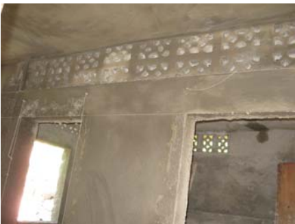
Wall finishing in kitchen depot.