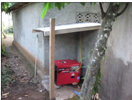
New NLH generator.

Last year we purchased a new diesel Apache generator. However after running it for two hours it broke down. We