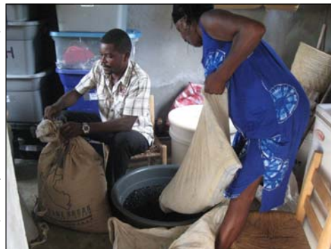
Measuring out beans for 2010 program.

Last year we started a program to loan beans to the farmers that attend the six Baptist churches in the Marfranc district. We loaned over 270 mamits (3,240 cups) of beans to 55 farmers. All but one of those farmers paid back their beans with interest (two cups per mamit). It was a great success. We had a few glitches, but Vilex assures me that we can work those out.